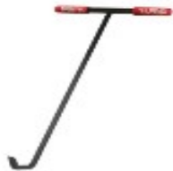
WATER HOOK USED TO LIFT SIDEWALK AT METER LOCATION

If you are unable to manage the water shut off, you may also call water utilities 24-hour emergency number CityLink 311 or 336-727-8000 and cross your fingers help makes a timely appearance. (I actually called 311 and received a prompt response, although the calls are answered in the order received so maybe I just got lucky!)