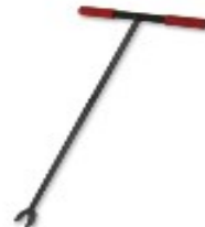
WATER VALVE SHUT OFF WRENCH